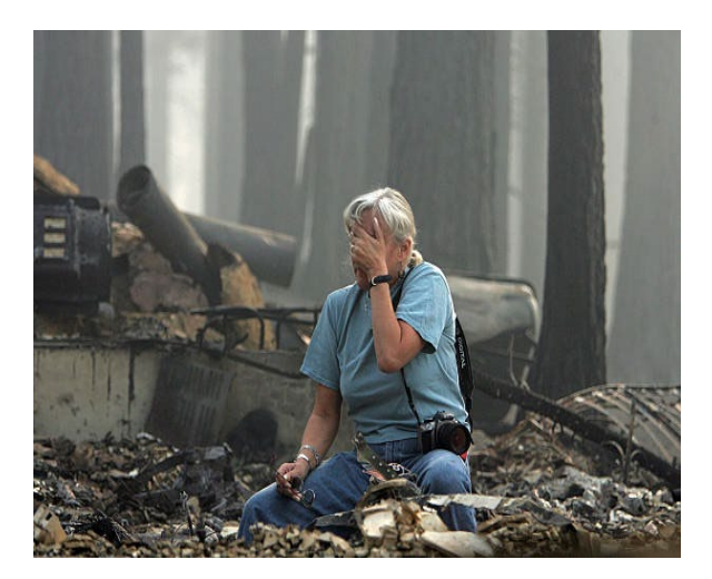
It's ALL GONE