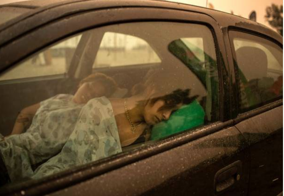
Burned out of HOME