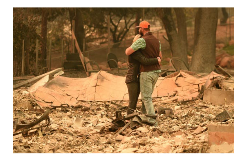
We lost it ALL, except Ourselves & MEMORIES