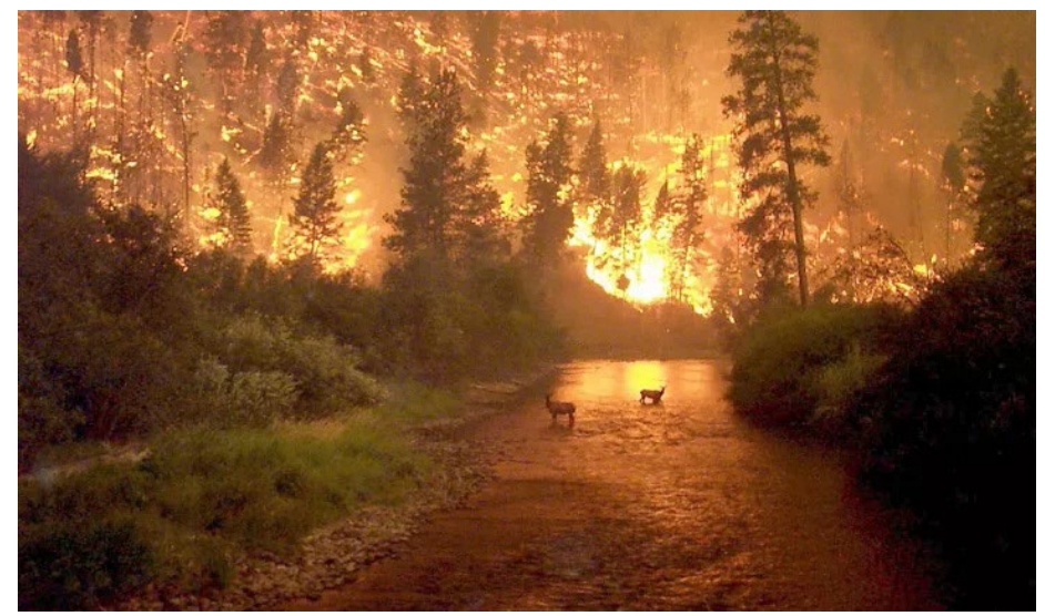
Deer take Refuge from Horror

4.8 million U.S. homes were identified at high or extreme risk of wildfire, with more than 2 million in California alone. Losses from wildfires added up to $5.1 billion over the past 10 years.* IBHS believes improving codes and installation guidance will result in reduced losses. Insurance Institute for Business & Home Safety (IBHS)